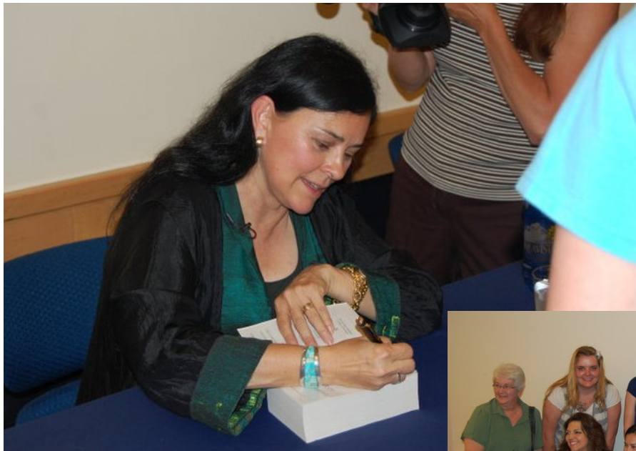
Left: Author Diana Gabaldon signs books at UW on July 6th. Below: Librarians from Sweetwater County take a moment to pose with author Diana Gabaldon during their visit to her presentation.